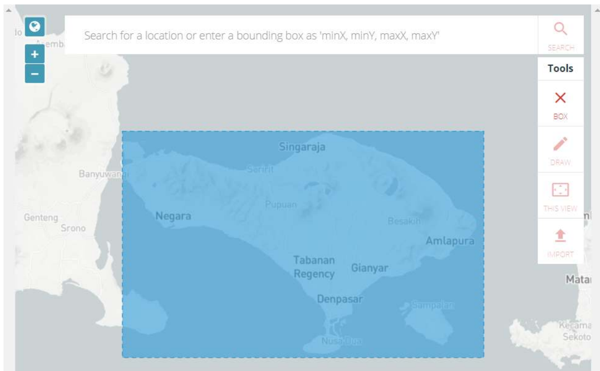
Figure 1: Bounding box