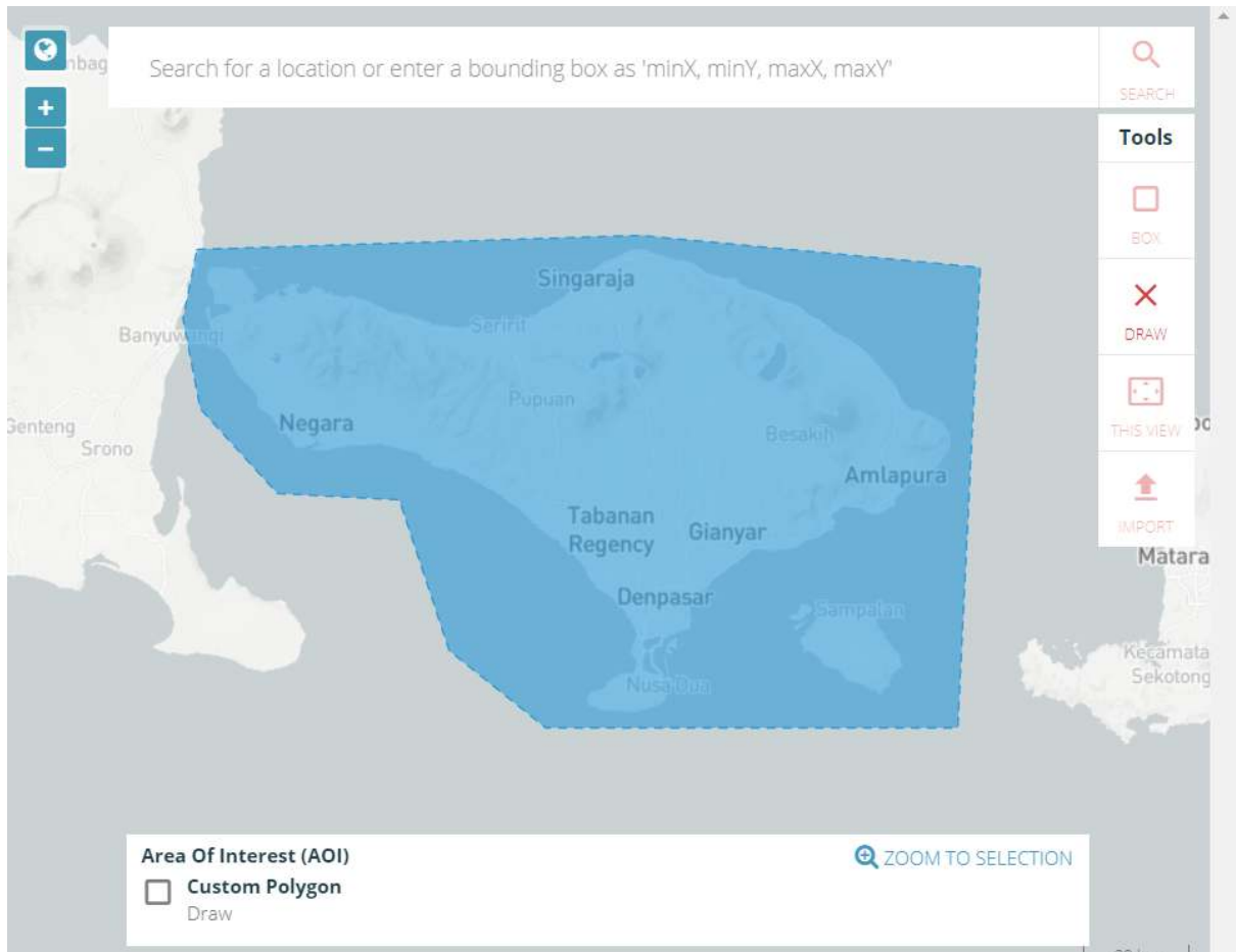
Figure 2: Manually edit