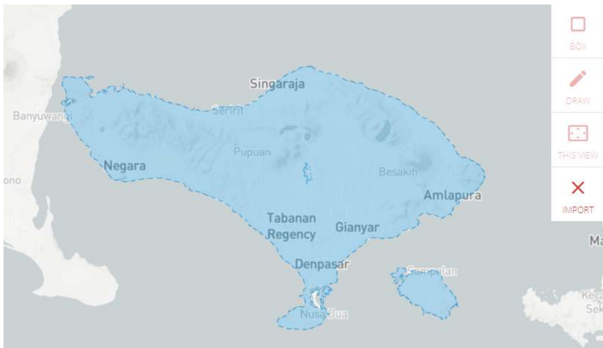
Figure 3: Import the administrative boundary