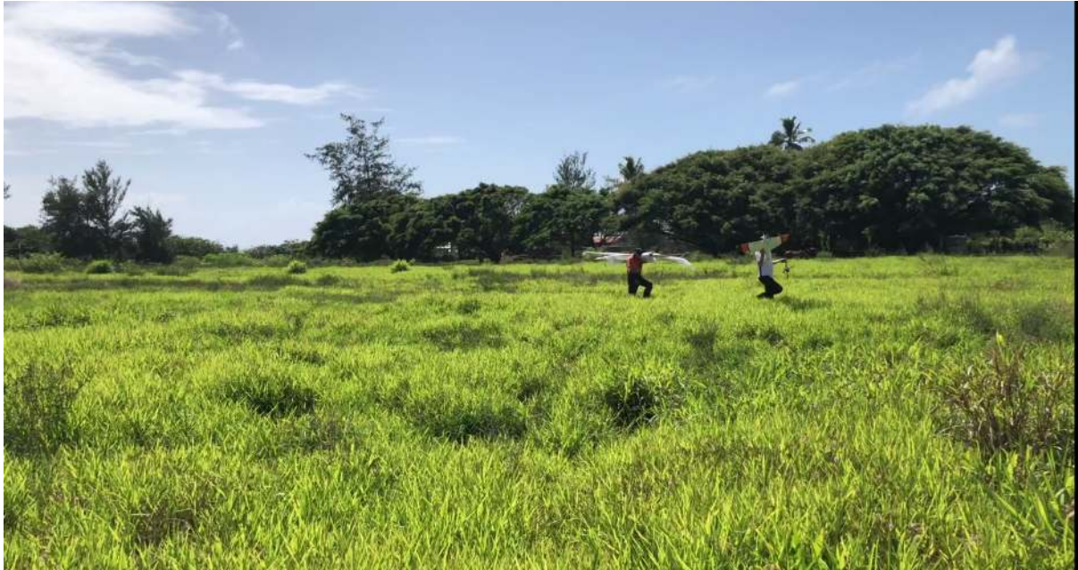
Figure 2: alt_text

space with an even surface (such as a sports field) is often ideal. Site selection should begin with a desktop assessment using maps and images, and then include an in-person visit to ensure that the location is suitable for takeoff and landing.