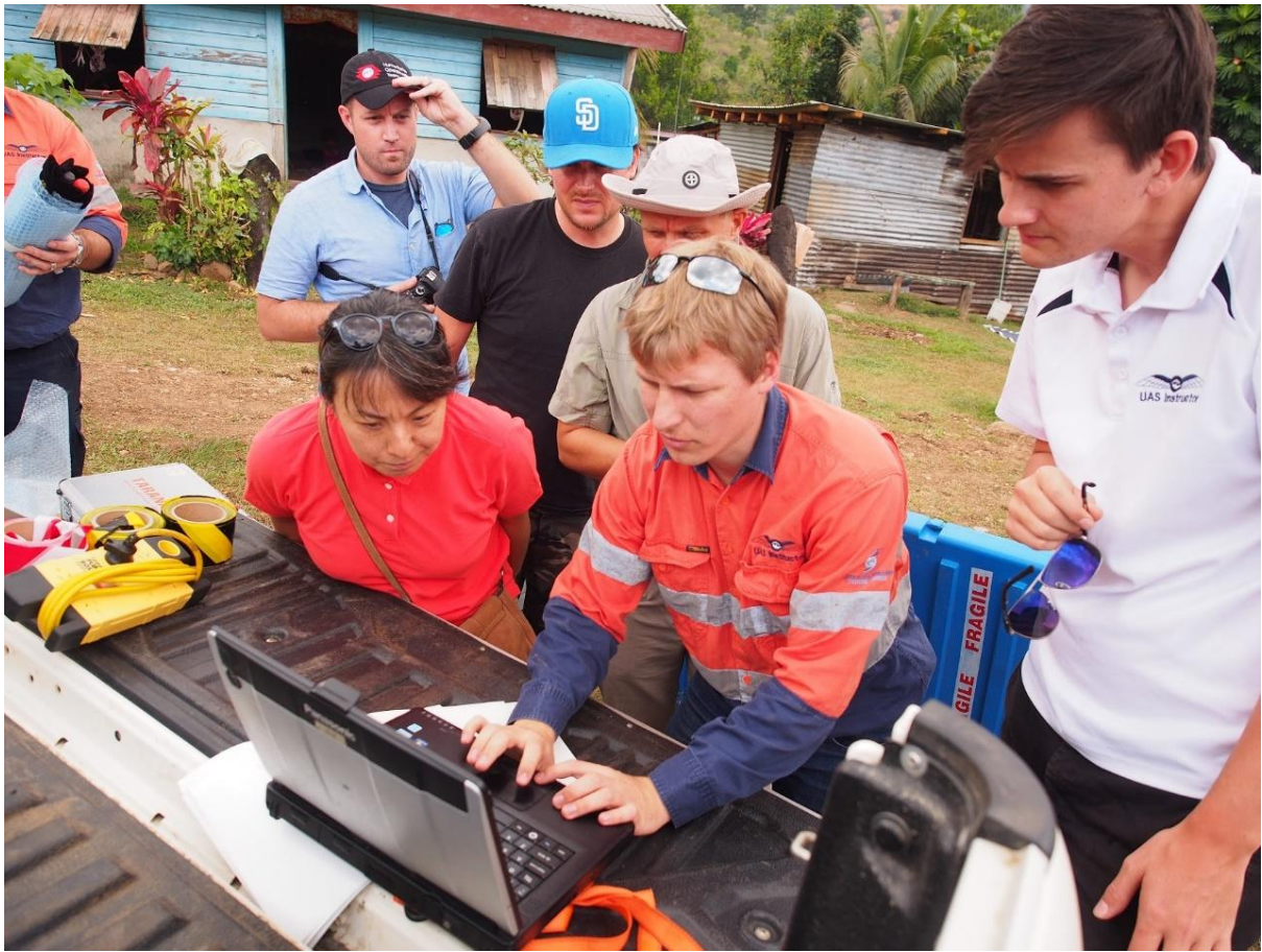
Figure 5: alt_text