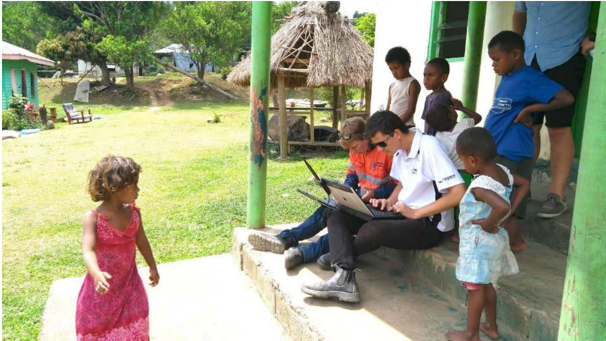
Figure 3: alt_text