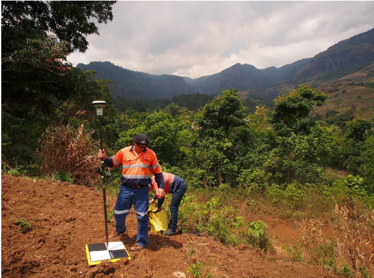
Figure 6: alt_text

Figure 10. Placing of a ground control point. The accurate coordinates of this GCP are surveyed on the spot using high-accuracy GPS.